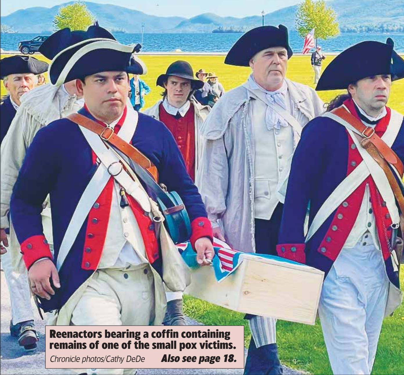
Reenactors bearing a coffin containing remains of one of the small pox victims. Also see page 18.

With ceremony & dignity, the found remains of 44 patriots who died in 1776 in Lake George were dedicated Friday, May 22, at a new monument in Battlefield Park