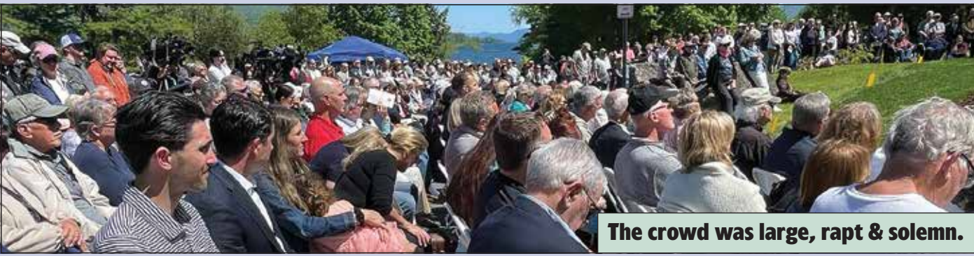
The crowd was large, rapt & solemn.

With ceremony & dignity, the found remains of 44 patriots who died in 1776 in Lake George were dedicated Friday, May 22, at a new monument in Battlefield Park