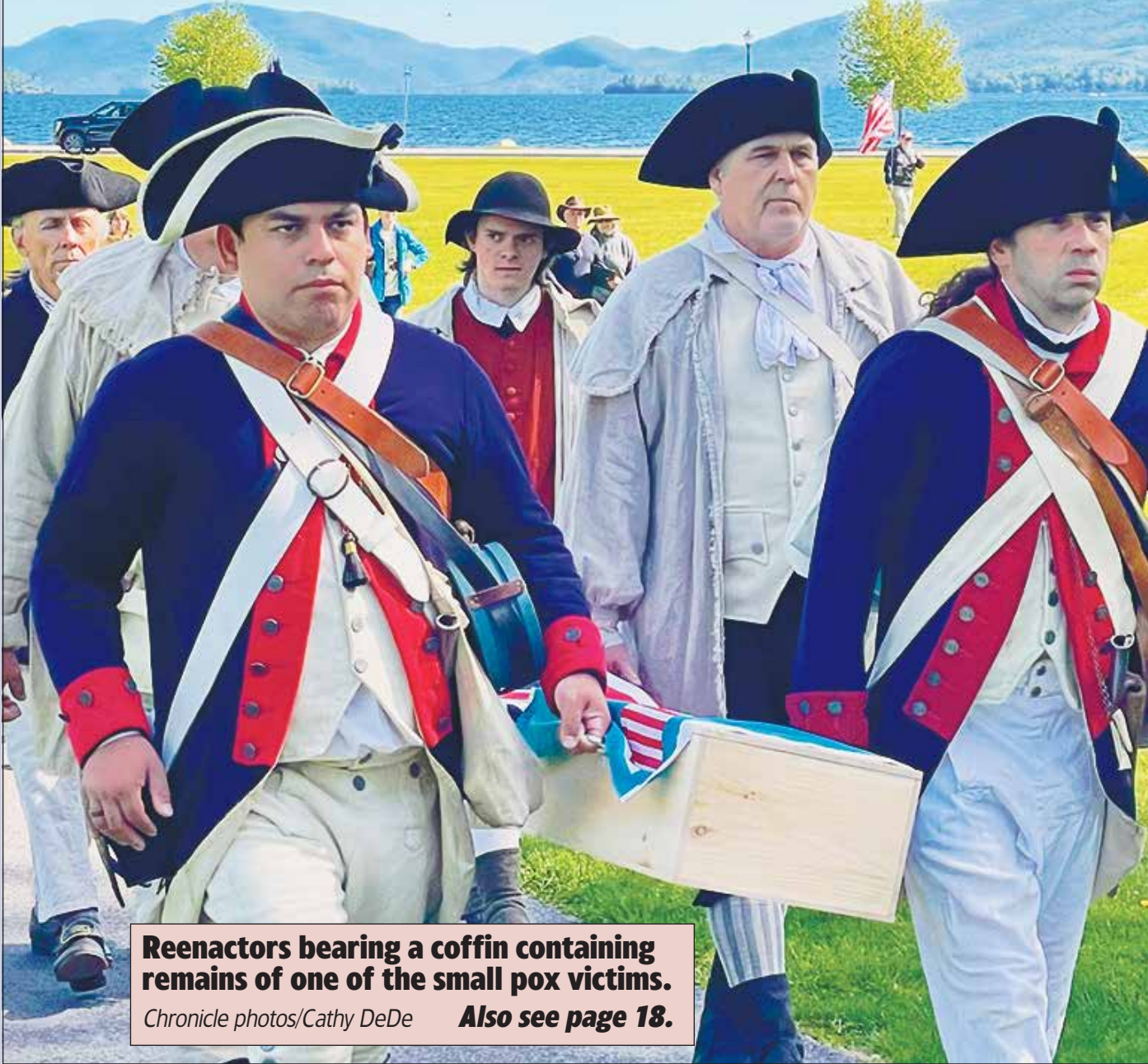
Reenactors bearing a coffin containing remains of one of the small pox victims. Also see page 18.

With ceremony & dignity, the found remains of 44 patriots who died in 1776 in Lake George were dedicated Friday, May 22, at a new monument in Battlefield Park