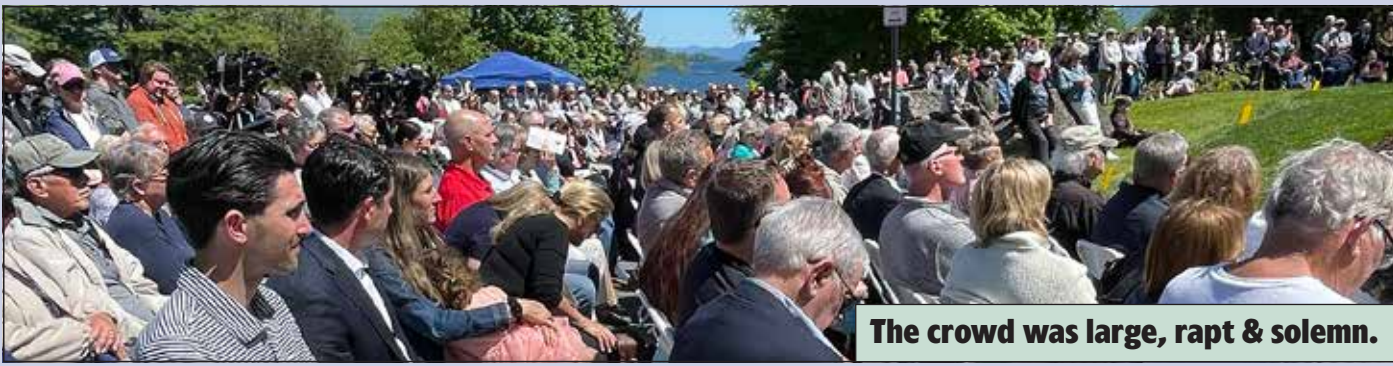
The crowd was large, rapt & solemn.

With ceremony & dignity, the found remains of 44 patriots who died in 1776 in Lake George were dedicated Friday, May 22, at a new monument in Battlefield Park