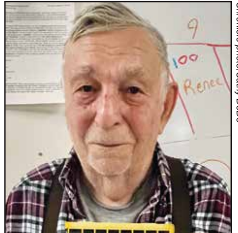
Still drives school bus at 89! ▶ 20