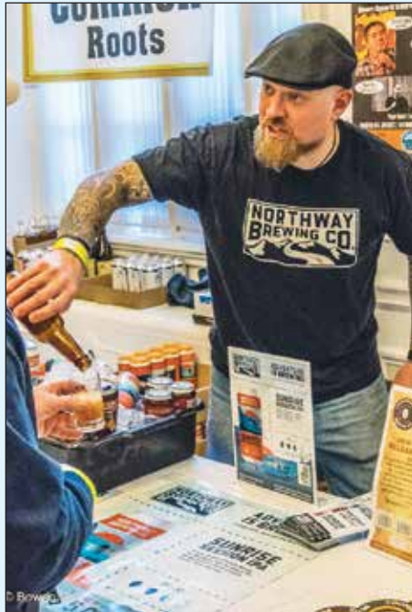
At the Queensbury Hotel — The Glens Falls Brewfest returns to its original home, Saturday, for two sessions.