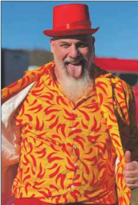
At the Shirt Factory — The Spice Beast , one of dozens of vendors at the Winter Meltdown Spicy Food Fest Saturday