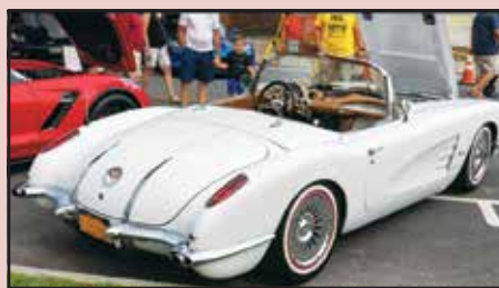
Adirondack VetteFest, Facebook photo.