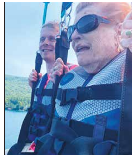
She went parasailing for 97th birthday ▶ 12