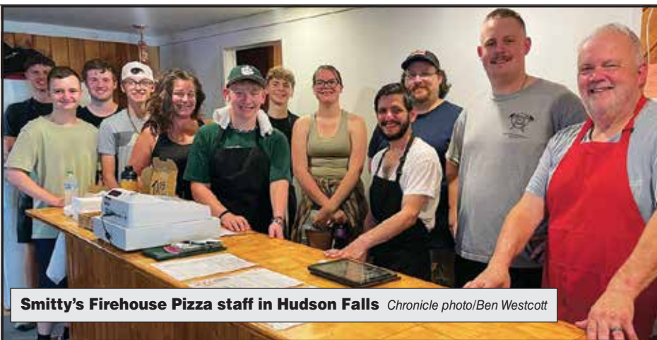
Smitty's Firehouse Pizza staff in Hudson Falls Chronicle photo/Ben Westcott