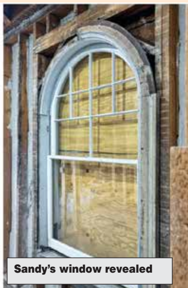
Sandy's window revealed