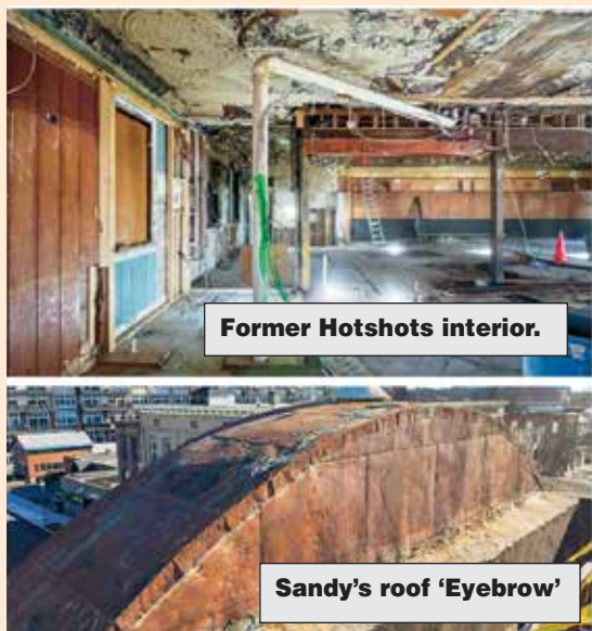
Former Hotshots interior.