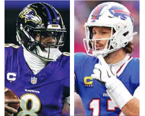
Lamar Jackson leads the Ravens. Josh Allen leads the Bills.