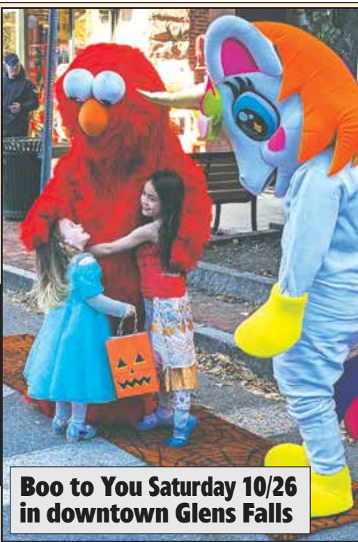
Boo to You Saturday 10/26 in downtown Glens Falls