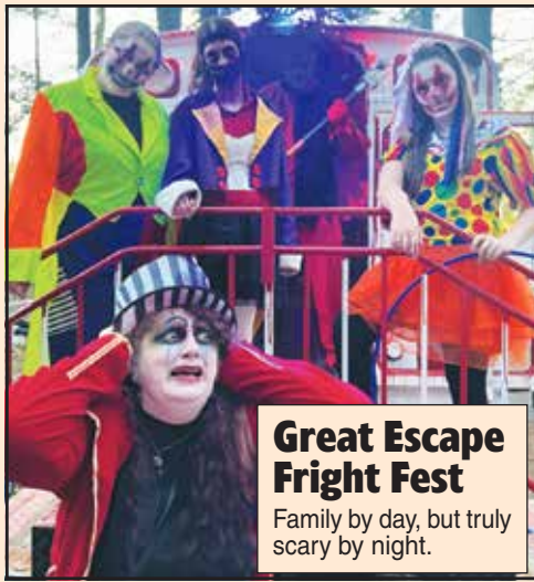
Great Escape Fright Fest

Family by day, but truly scary by night.