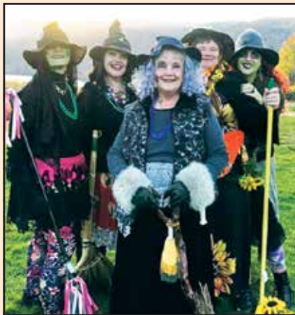
Gem Radio's Dancing Witches of the North Country. See events, p. 28.

Family by day, but truly scary by night.