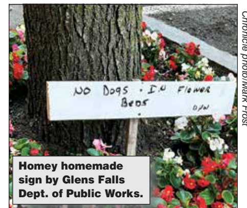
Homey homemade sign by Glens Falls Dept. of Public Works.