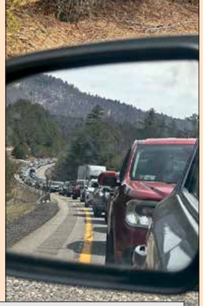
Top photos by Myles Bray in Plattsburgh and on the way to get there. Eclipse shot with a Canon EOS RP Sigma 150-600mm lens & Sun Catcher sun filter