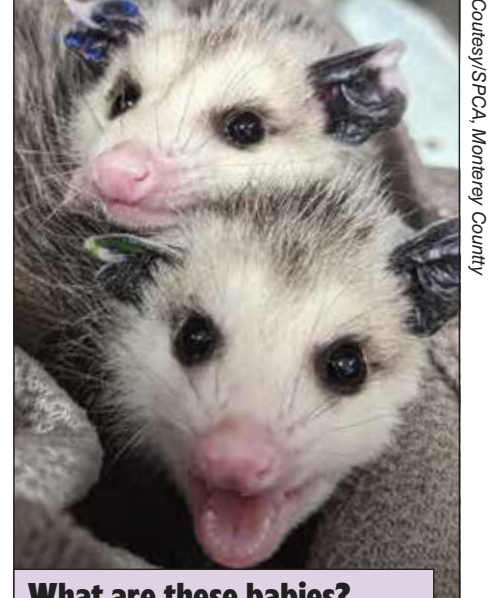
What are these babies? Answer in next week's Chronicle