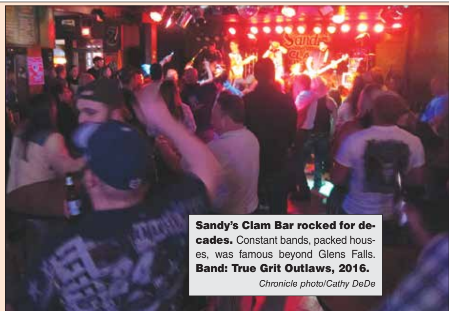
Sandy's Clam Bar rocked for decades. Constant bands, packed houses, was famous beyond Glens Falls. Band: True Grit Outlaws, 2016.

Q&A: Who will win in November ▶ 7 More Covid mail ▶ 14