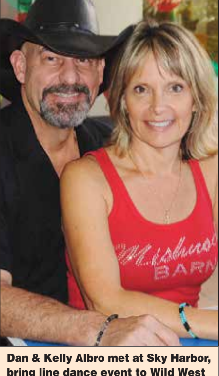
bring line dance event to Wild West