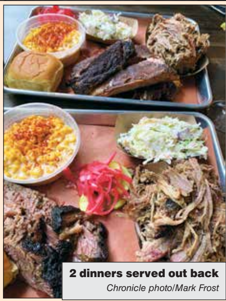
2 dinners served out back