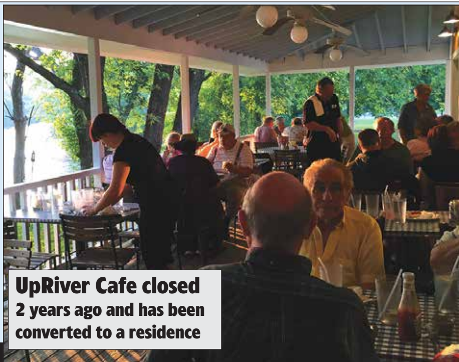
Upriver Cafe closed 2 years ago and has been converted to a residence

About Nettle Meadow & new 'Sweetie's' > 21