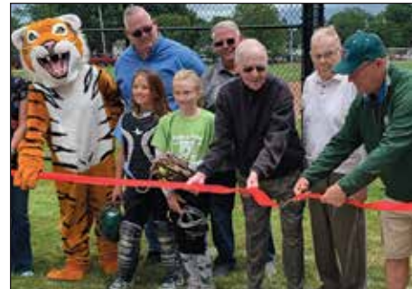
HF cut the ribbon > 9