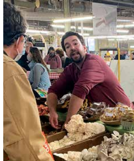
The Dorset Farmers Market takes place Sundays on the idle J.K. Adams wood-working factory floor. Here a mushroom vendor.