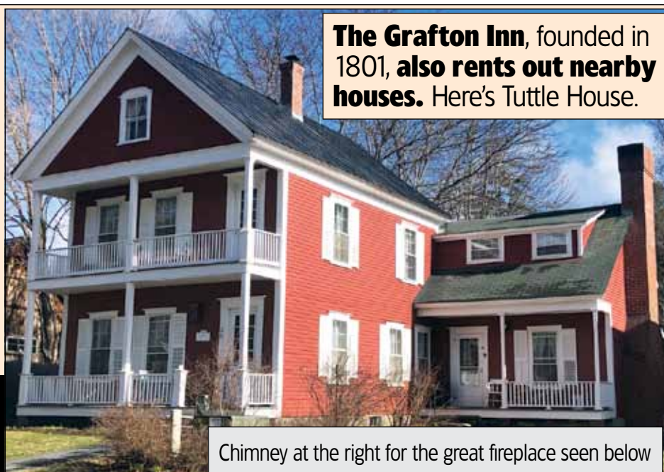
The Grafton Inn, founded in 1801, also rents out nearby houses. Here's Tuttle House.

Dogs okay; working fireplace, plenty of seasoned wood: A perfect long weekend in Grafton, VT