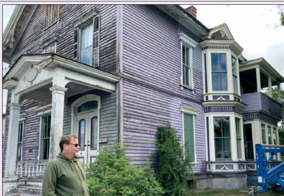
The handsome new paint job on the side caught The Chronicle's eye.

Mark: Biz pulse ▶ 8 Calendar ▶ 18-20 Real estate ▶ 23-25