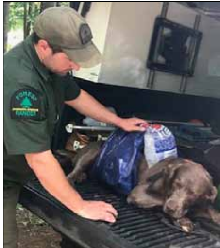
This dog nearly died from severe heat stress. NYS Forest Rangers helped save it, but they urge people not to take dogs hiking on hot days.