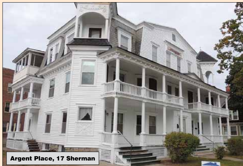
Argent Place, 17 Sherman

at 1 Holman Street , with 12 units in a brick exterior building that is reminiscent of New York City back in the day. I'm told it was designed as an investment