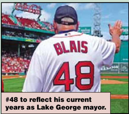
#48 to reflect his current years as Lake George mayor.