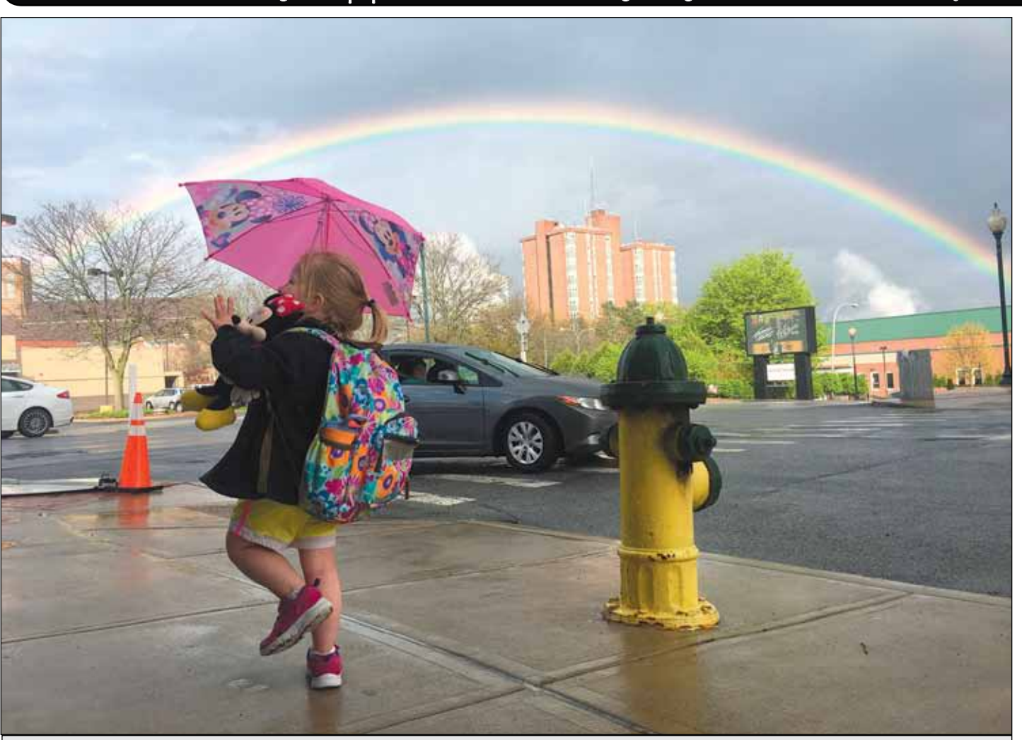
Minnie Mouse & the Glens Falls rainbow