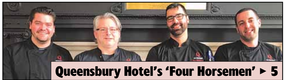
Queensbury Hotel's 'Four Horsemen' > 5