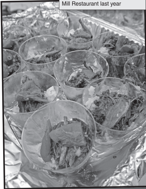
Beef is always popular! Pictured: Braised Short Ribs from The Grist Mill Restaurant last year