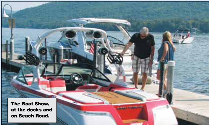
The Boat Show, at the docks and on Beach Road.