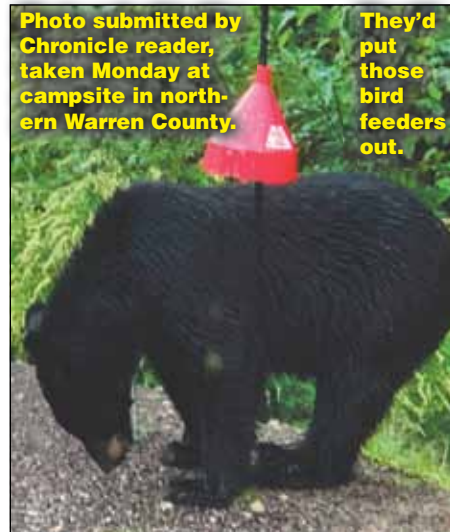
Photo submitted by Chronicle reader, taken Monday at campsite in northern Warren County.