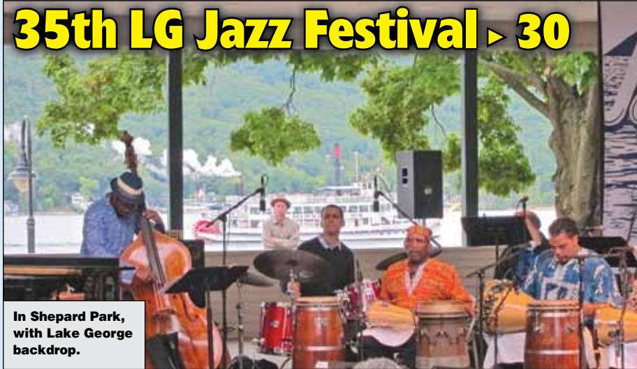
In Shepard Park, with Lake George backdrop.