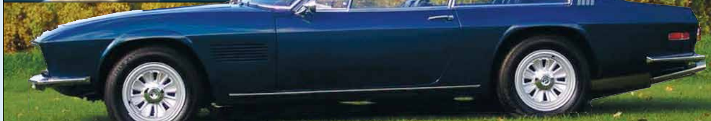
Rare Swiss 1971 Monte Carlo 375L, scheduled at Hemmings.