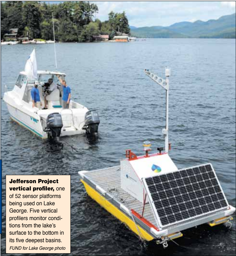
Jefferson Project vertical profiler , one of 52 sensor platforms being used on Lake George. Five vertical profilers monitor conditions from the lake’s surface to the bottom in its five deepest basins.

Good news: Streams ‘full of life’ & algae isn’t rapidly increasing