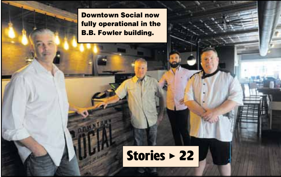
Downtown Social now fully operational in the B.B. Fowler building.