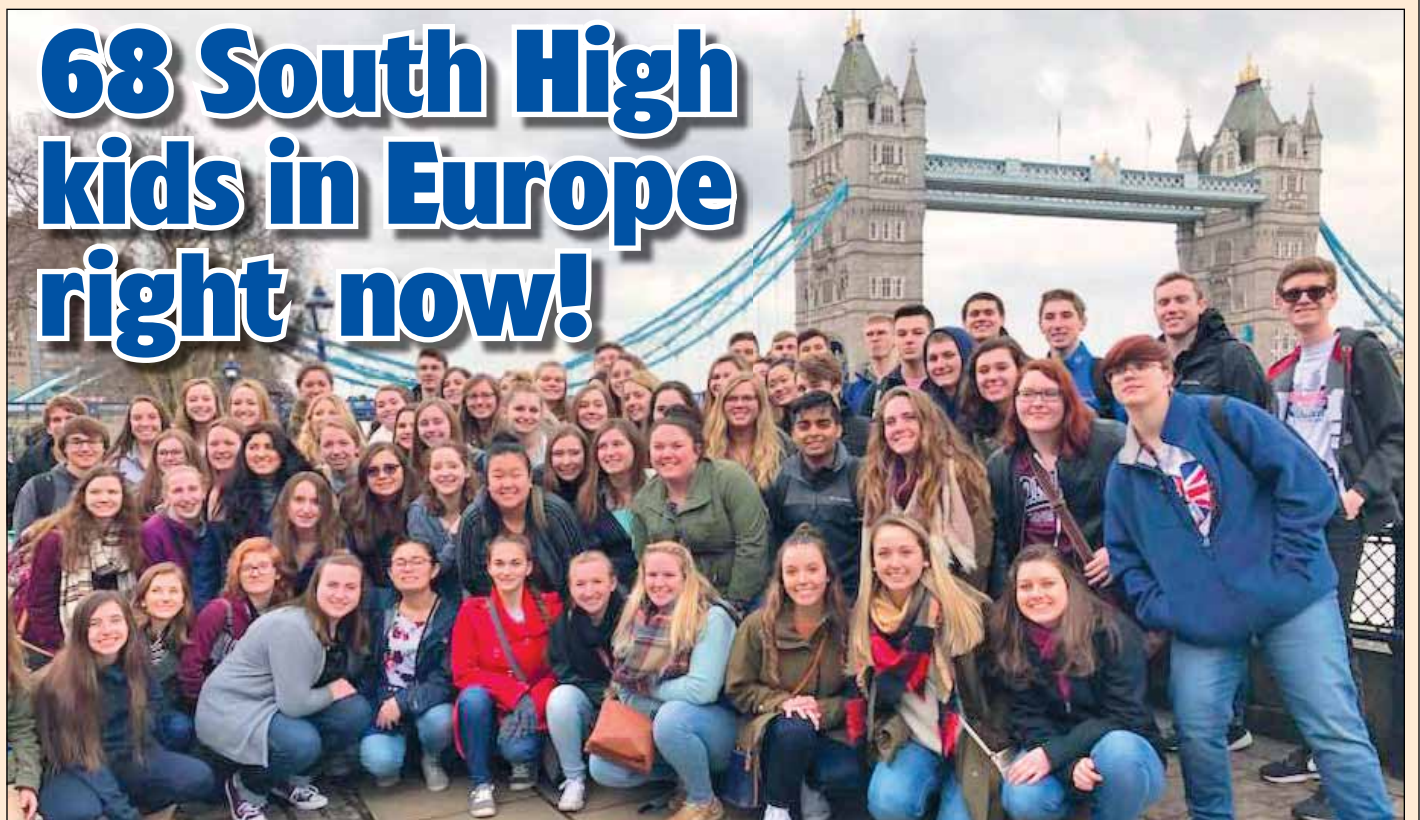
Photo: in front of London's Tower Bridge