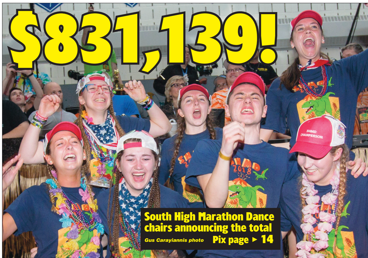
South High Marathon Dance chairs announcing the total Pix page ▶ 14