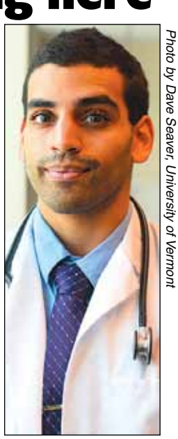
Please turn to page 7

"I love it. I would stay if I could," Sunit