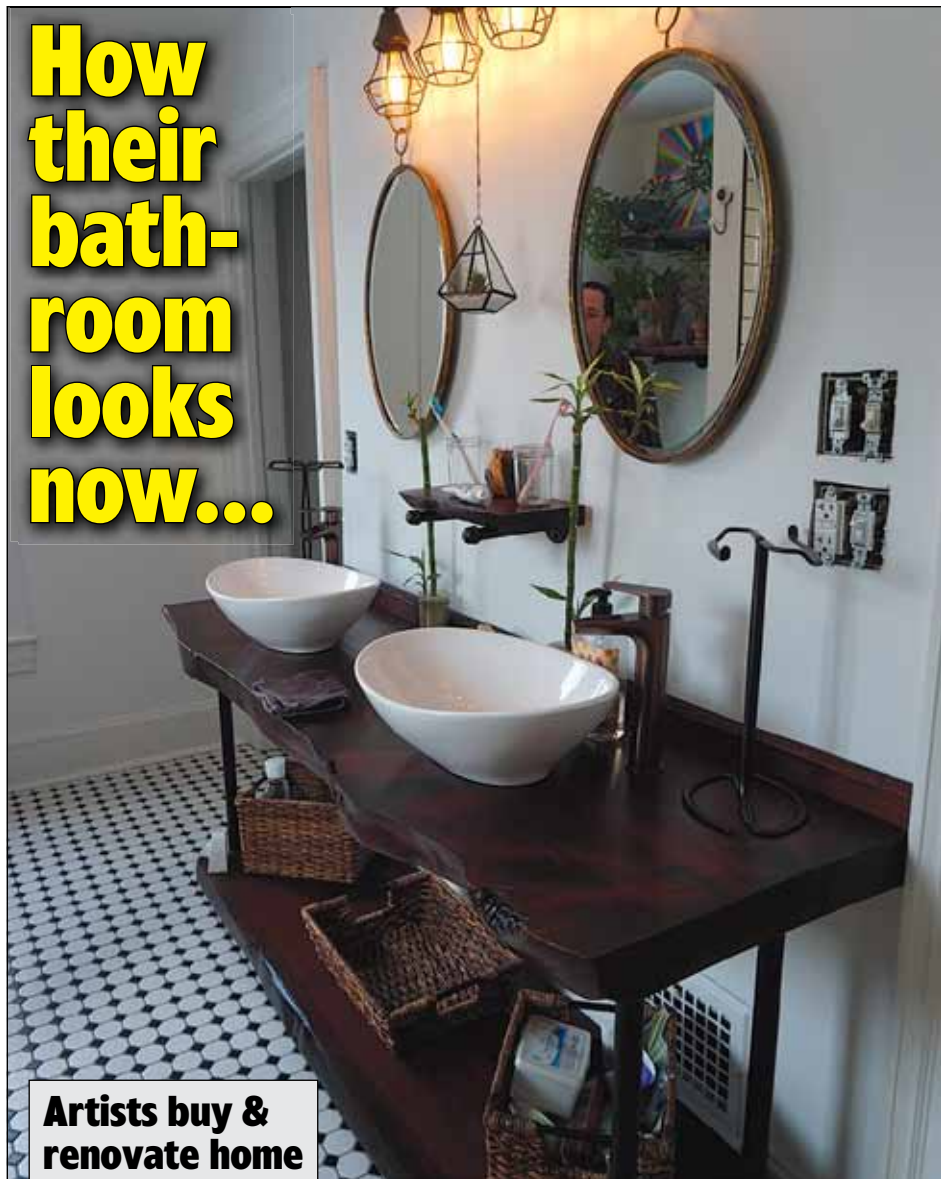
Artists buy & renovate home in Glens Falls ▶ 12