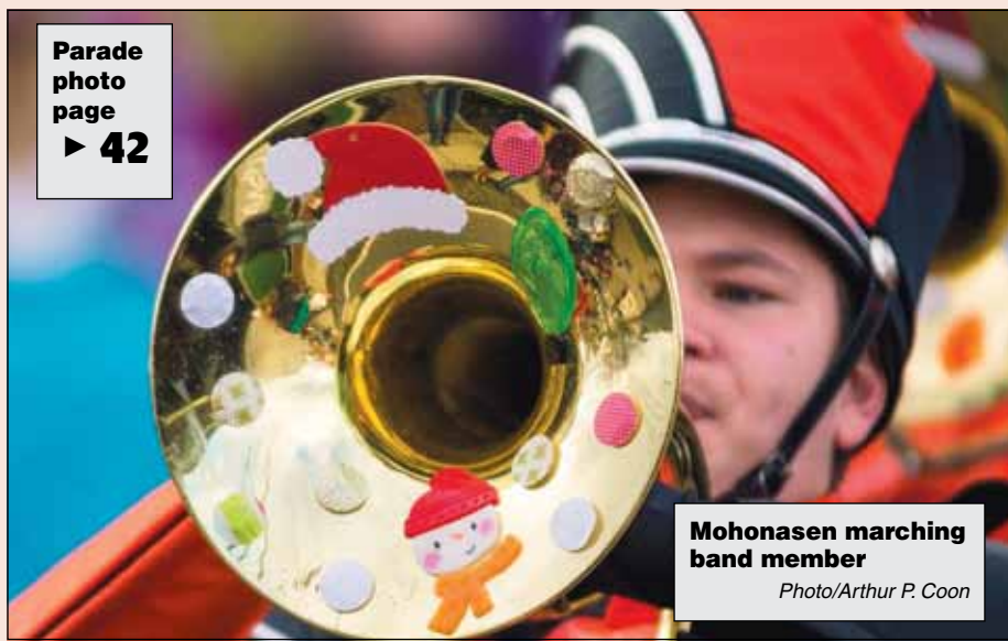
Parade photo page ▶ 42