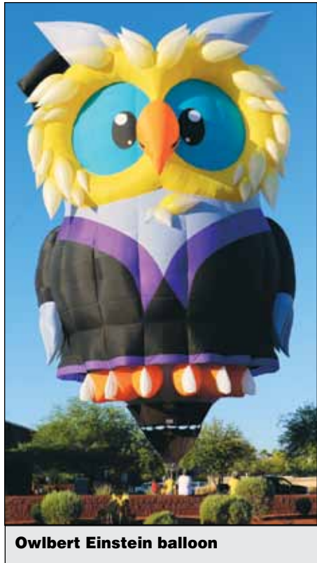
Owlbert Einstein balloon