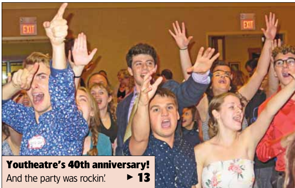
Youtheatre's 40th anniversary! And the party was rockin' ▶ 13