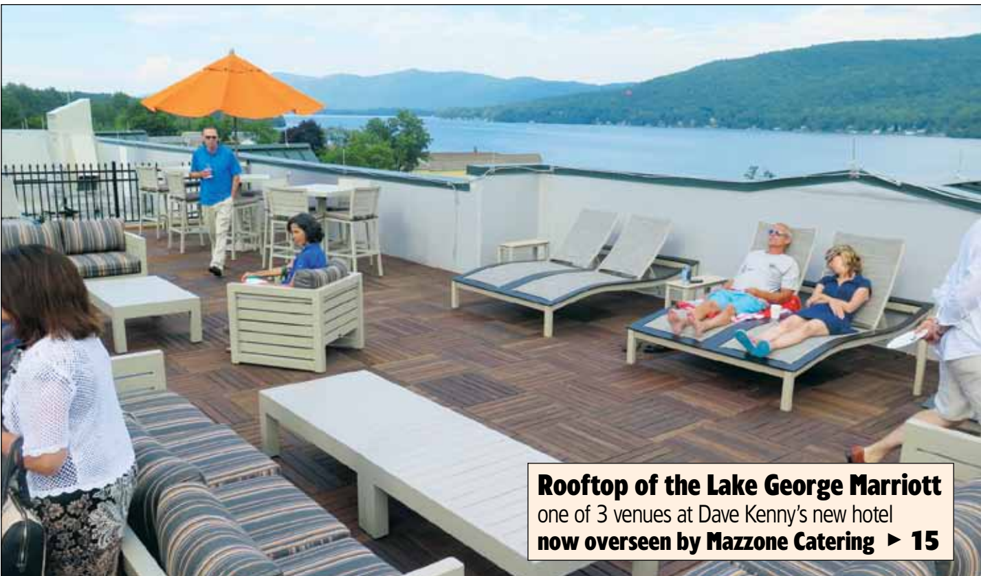
Rooftop of the Lake George Marriott one of 3 venues at Dave Kenny's new hotel now overseen by Mazzone Catering ▶ 15

10 sales of $1-million & up; 15 at same point last year. Too little inventory?