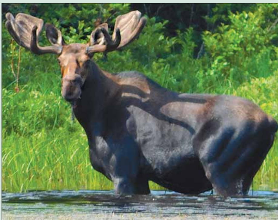
Dan Ladd took this photo on July 10 and estimates the bull moose weighed 600 pounds.

Encounter big bull as they paddled Cedar River Flow