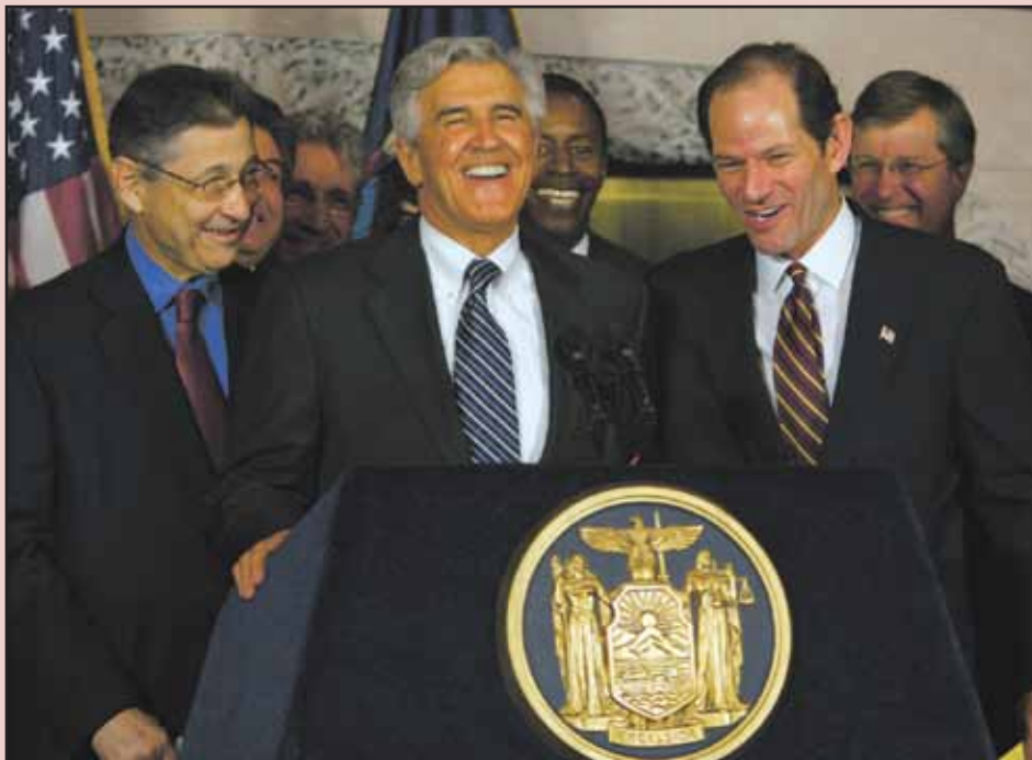
'Three men in a room' — At the peak of his career, Joe Bruno , center, was the New York State Senate Majority Leader who, with Assembly Speaker Sheldon Silver , left, and Governor Eliot Spitzer , largely controlled the legislation enacted in New York State.