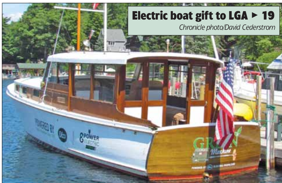
Electric boat gift to LGA ▶ 19