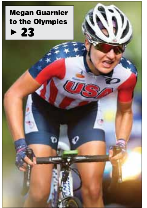
Megan Guarnier to the Olympics ▶ 23