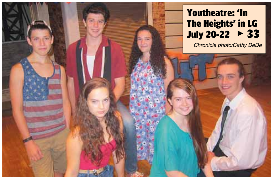
Youtheatre: 'In The Heights' in LG July 20-22 ▶ 33

125-foot height, 1,000-foot drop, 55 mph top speed, $45 price