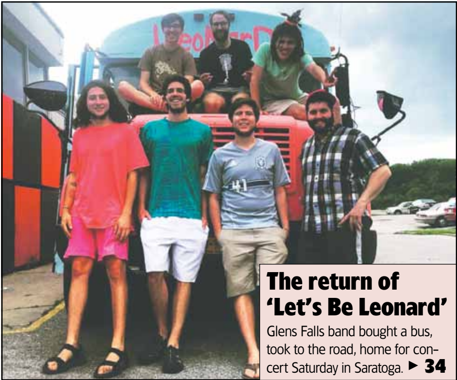
The return of 'Let's Be Leonard'

Glens Falls band bought a bus, took to the road, home for concert Saturday in Saratoga. ▶ 34