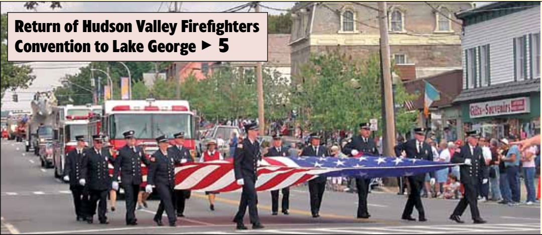
Return of Hudson Valley Firefighters Convention to Lake George ▶ 5