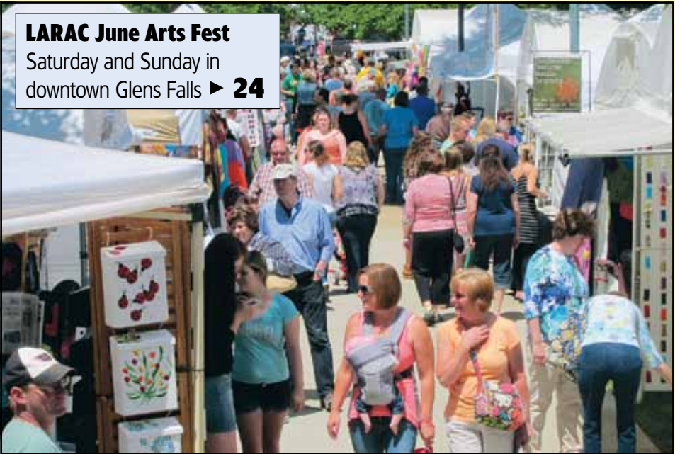
LARAC June Arts Fest Saturday and Sunday in downtown Glens Falls ▶ 24

The mid-June frenzy includes: • The LARAC June Arts Fest at City Park this weekend in downtown Glens Falls. Zonta's 56th Country Faire takes place right across the street. • Hudson Valley Volunteer Firefighters Convention in Lake George. • Adirondack Woof Stock — the north country dog fest with a Woodstock flavor — in Chestertown. • Check our calendar for more!