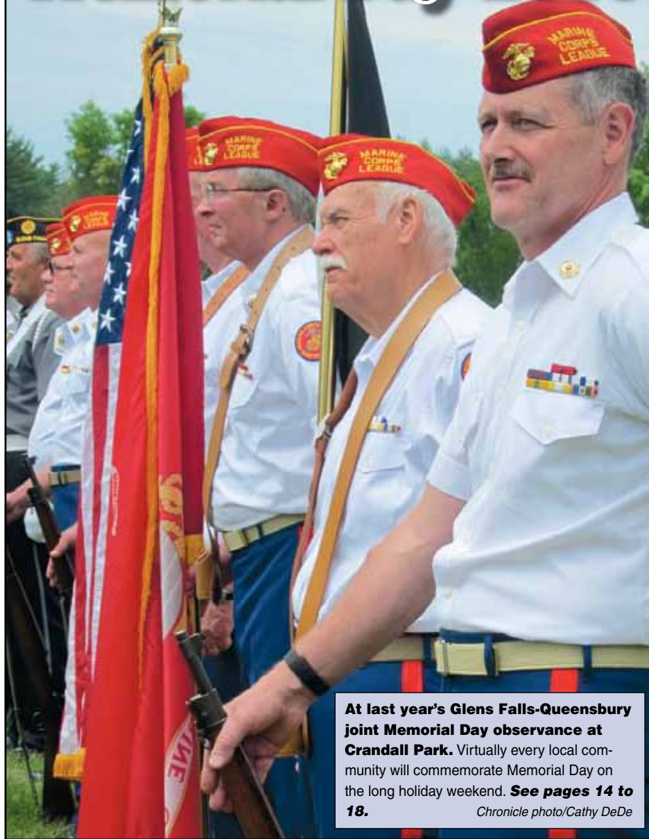
At last year's Glens Falls-Queensbury joint Memorial Day observance at Crandall Park. Virtually every local community will commemorate Memorial Day on the long holiday weekend. See pages 14 to 18.