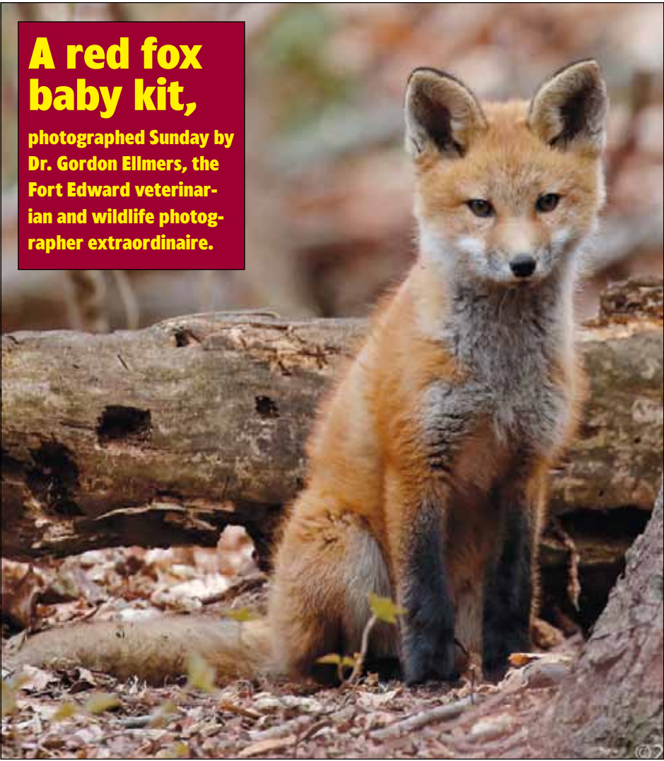
A red fox baby kit