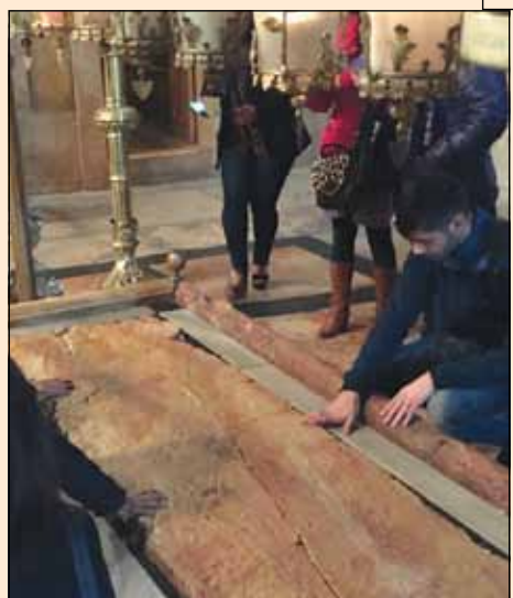
Stone of Unction — After the crucifixion, site where Jesus's body was said to have been prepared for burial (not on that actual stone).