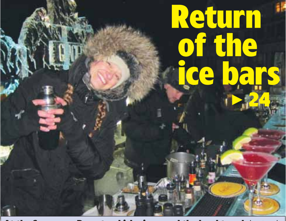
At the Sagamore Resort, which pioneered the local trend, bartenders last year wore signature fur-trimmed jackets for the over-the-top event.