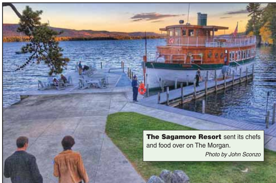
The Sagamore Resort sent its chefs and food over on The Morgan .