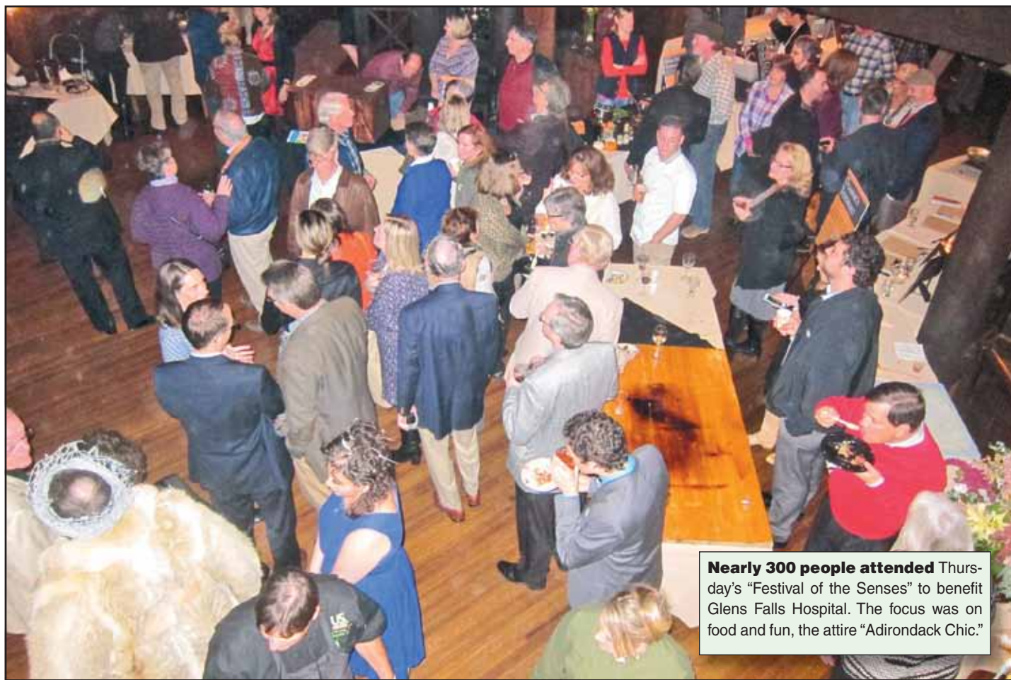
Nearly 300 people attended Thursday's "Festival of the Senses" to benefit Glens Falls Hospital. The focus was on food and fun, the attire "Adirondack Chic."

Some guests came dressed up, others dressed down in flannel, fur vests and hik-