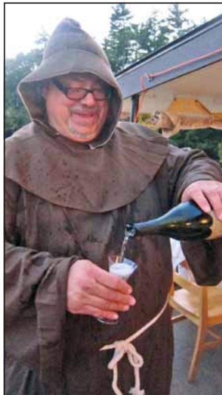
'Dom Perignon' pours Champagne.