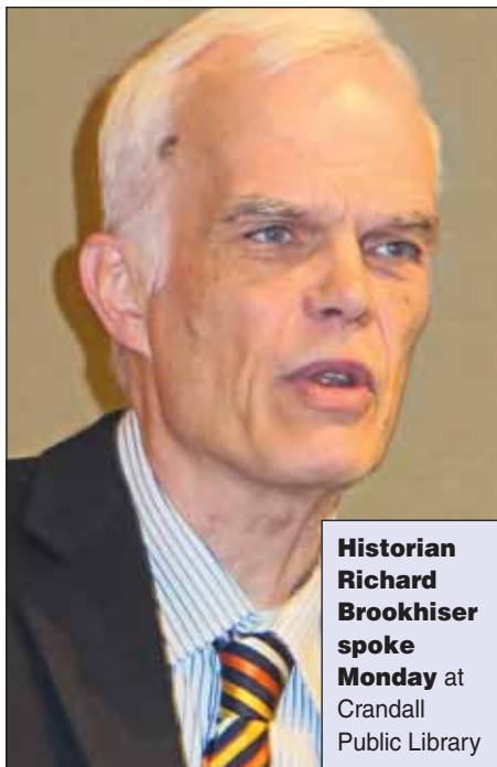
Historian Richard Brookhiser spoke Monday at Crandall Public Library