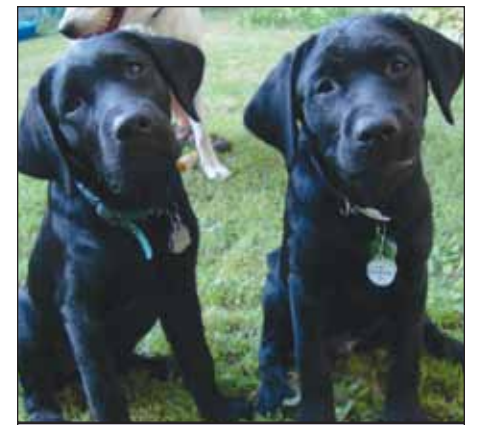
Brothers Caffrey, left, and Cy are both being raised locally to be guide dogs.

GF Community Theatre sets Sweeney Todd ▶ 32