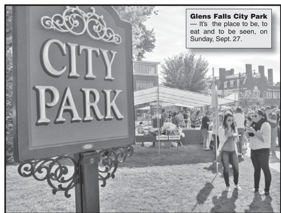
Glens Falls City Park — It's the place to be, to eat and to be seen, on Sunday, Sept. 27.