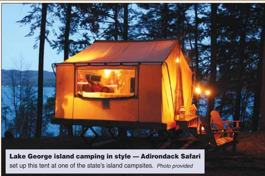
Lake George island camping in style — Adirondack Safari set up this tent at one of the state's island campsites.

Camping the easy way; lots of takers, including Bob Blais