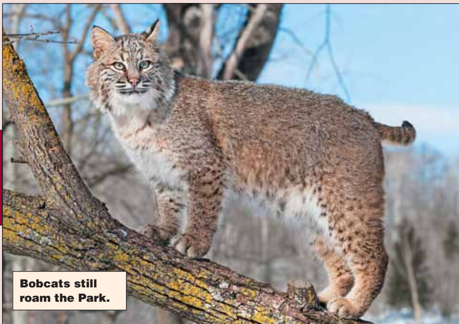
Bobcats still roam the Park.