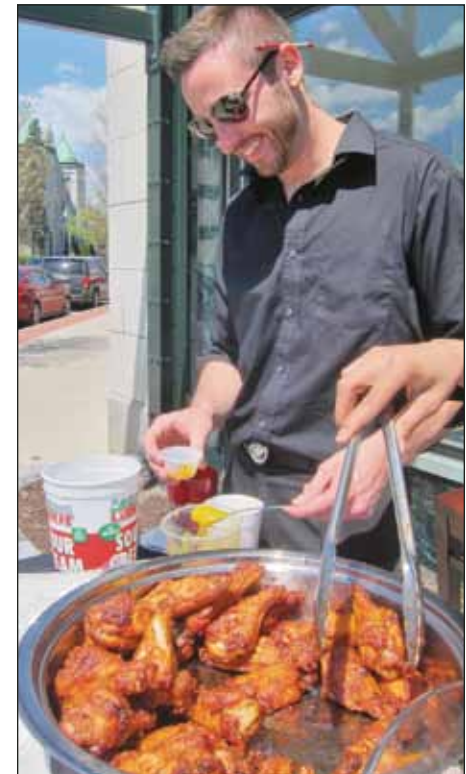
Wing Fest success ▶ B6