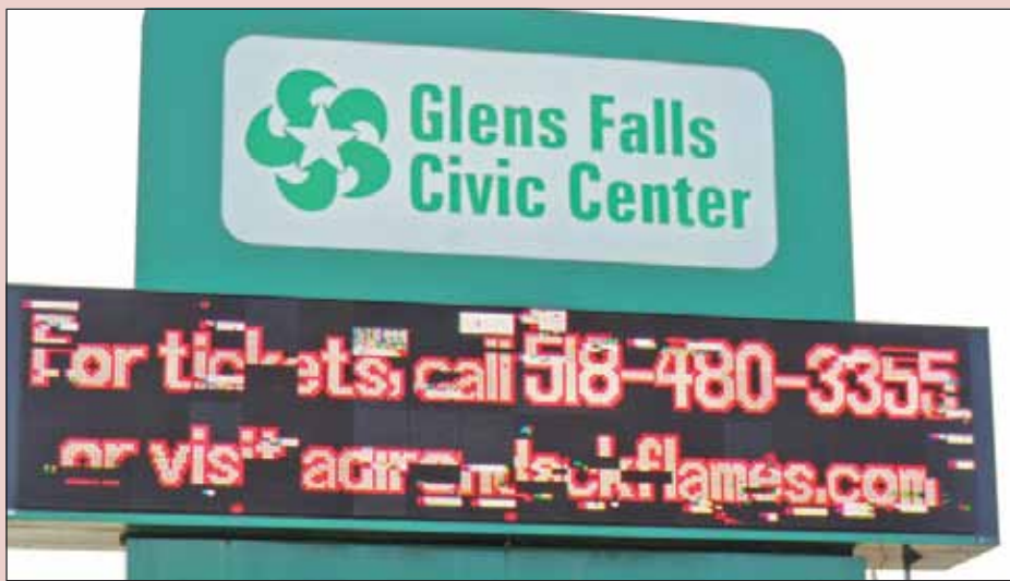
The south-facing portion of the Civic Center sign hasn't worked in nearly two years. The new sign will likely add video capacity.

said. "That is the first thing that will be done." He estimated the marquee upgrade will take up